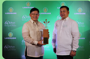
Top in Link.BizPortal Utilization PHILIPPINE NATIONAL POLICE