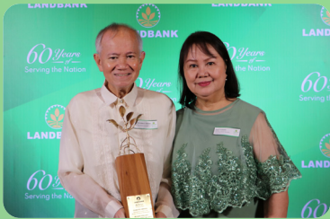
Outstanding Partner in Health Services ALLAH VALLEY MEDICAL SPECIALISTS' CENTER, INC.