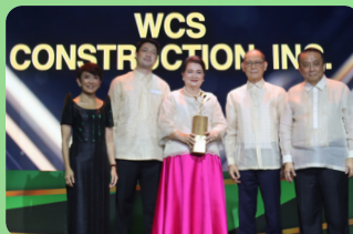
WCS CONSTRUCTION INC.