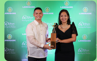
Top Remittance Partner through LBRS (International) WESTERN UNION