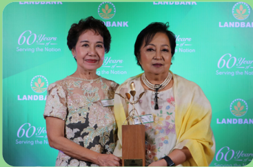
Outstanding Partner in Learning and Development JUAN SUMULONG MEMORIAL SCHOOLS SYSTEMS INC.