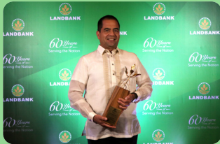
Top Agent Banking Partner RURAL BANK OF SIPOCOT (CAMARINES SUR), INC.