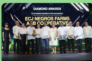
ECJ NEGROS FARMS ARB COOPERATIVE