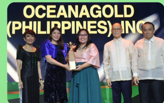
OCEANAGOLD (PHILIPPINES) INC.