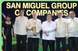
SAN MIGUEL GROUP OF COMPANIES