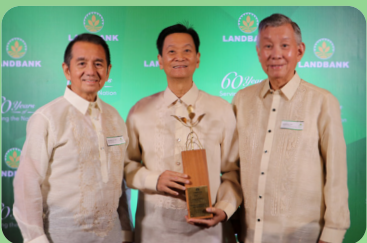
Outstanding Partner in Socialized Housing Development FIESTA COMMUNITIES INCORPORATED