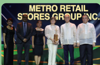
METRO RETAIL STORES GROUP INC.