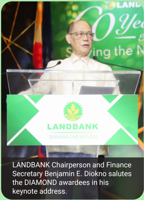
LANDBANK Chairperson and Finance Secretary Benjamin E. Diokno salutes the DIAMOND awardees in his keynote address.

Secretary Diokno delivered a keynote address saluting awardees and underscoring LANDBANK’s role in sustaining economic momentum: “To our DIAMOND awardees, let me express my profound gratitude and admiration for each and every one of you for your contributions in accelerating the post-pandemic recovery of our local economy. [...] And having LANDBANK as your reliable partner to service your expansion and development requirements. Together, we can build a more resilient, inclusive, and sustainable economy where no one is left behind.”