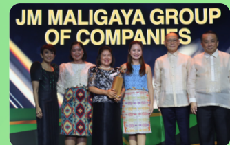
JM MALIGAYA GROUP OF COMPANIES