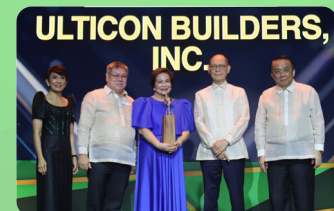
ULTICON BUILDERS, INC.