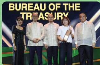
BUREAU OF THE TREASURY