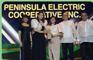
PENINSULA ELECTRIC COOPERATIVE, INC.